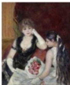
Age of Impressionism