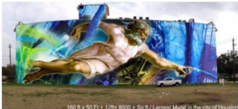
160 ft x 50 Ft + 12ft= 8000 + Sq ft / Largest Mural in the city of Houston

Join us as we unveil Houston's largest mural! "Preservons la creation / Let's Preserve the Creation" By Sebastien "Mr. D" Boileau With the largest re-installation of the Open the Door project Live music, performances, cocktail and lite bites